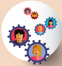
Making the Right Match