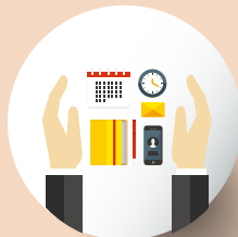
Real-time Tracking Diary