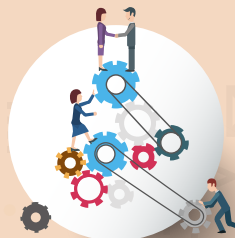
Business Matchmaking Team Assistance